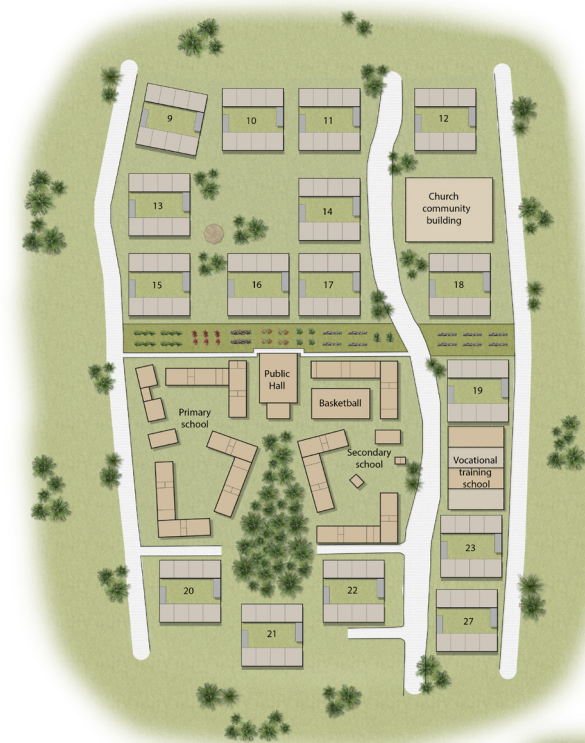
Middle site plan