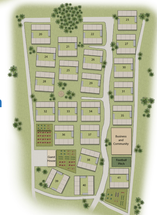
Lower site plan