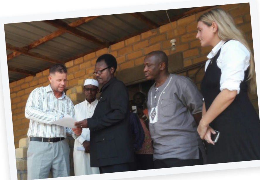
Sierra Leone's Vice-President reviews the plans

Home Leone has developed its relocation plan with input from across the nation's leaders. The Vice President, Presidents Chief of Staff and Presidential nominees have all visited. Using words such as "inspirational" and "impressive," they recognise the key contribution Home Leone is making.